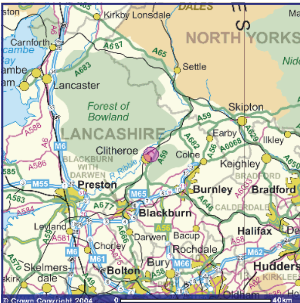
Images produced from the Ordnance Survey Get-a-map service. Image reproduced with kind permission of Ordnance Survey and Ordnance Survey of Northern Ireland

ENTRIES FOR PRE SALE CATALOGUE INCLUSION CLOSE ON FRI 15TH APRIL